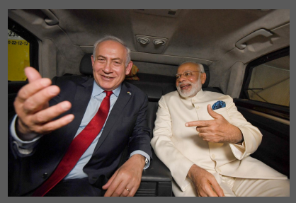
Modi: "The people of Israel have built a nation on democratic principles. They have nurtured work, grit and the spirit of innovation. You have marched on regardless of adversity achallenges into opportunity. India applauds your achievements."